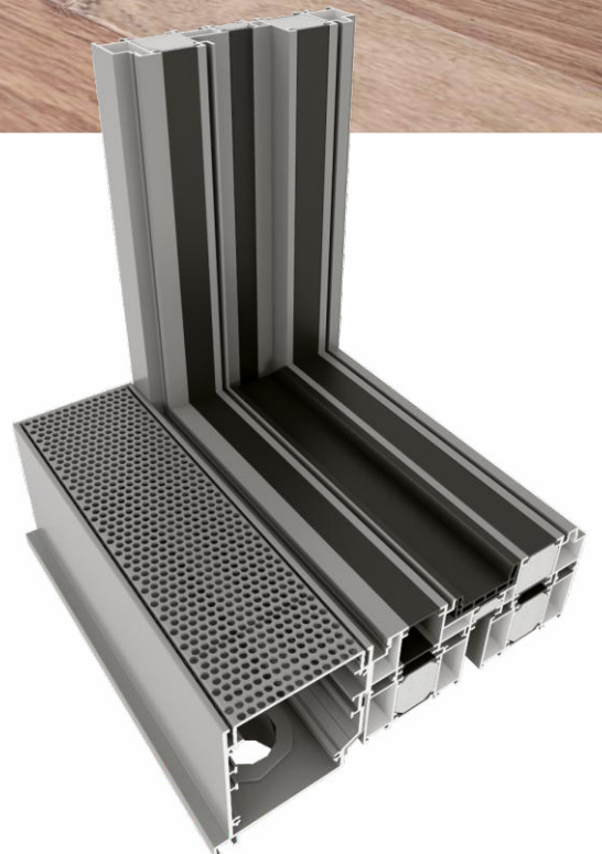
Photo: Example of system use

The linear drainage system of the Yawal company is equipped in specially designed connectors which make it possible to bend the gutter at any angle.